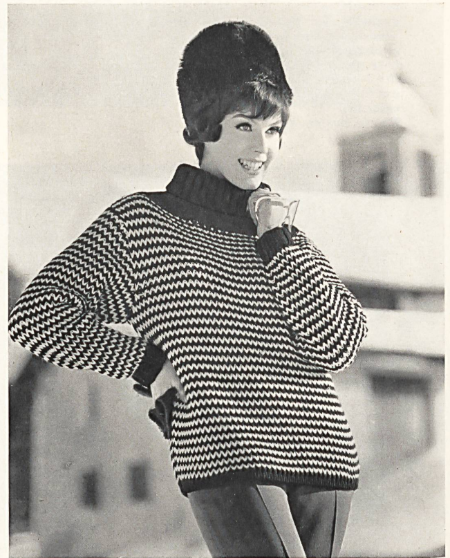
Sports and ski sweater in heavy two-toned knit, with roll collar fitted very low

and women workers labour with love and care on the manufacture of the most varied models of pullovers, jackets and dresses, shortly to be dispersed throughout some two dozen countries where they will be the pride and joy of countless women.