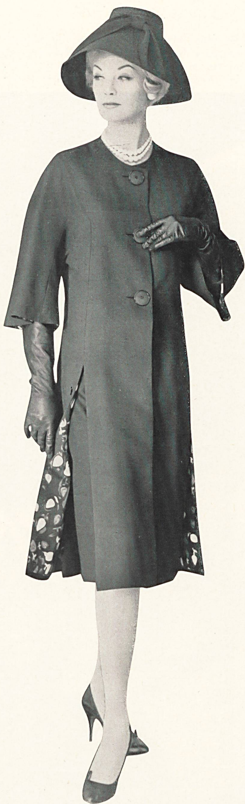
« ZURRER », WEISBROD-ZURRER FILS, HAUSEN s. A.