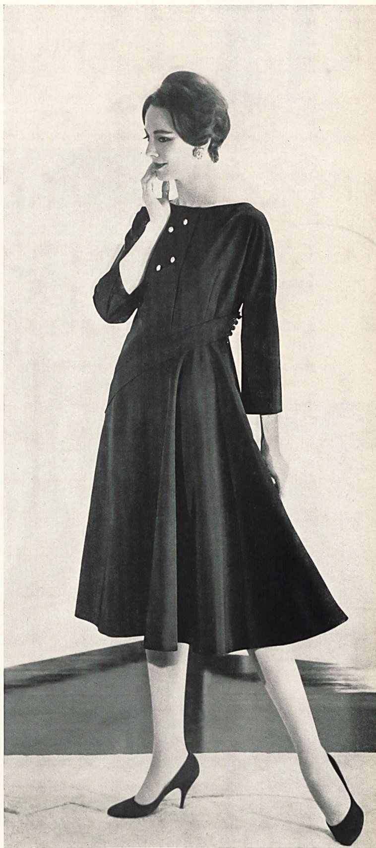
« ZURRER », WEISBROD-ZURRER FILS, HAUSEN s. A.