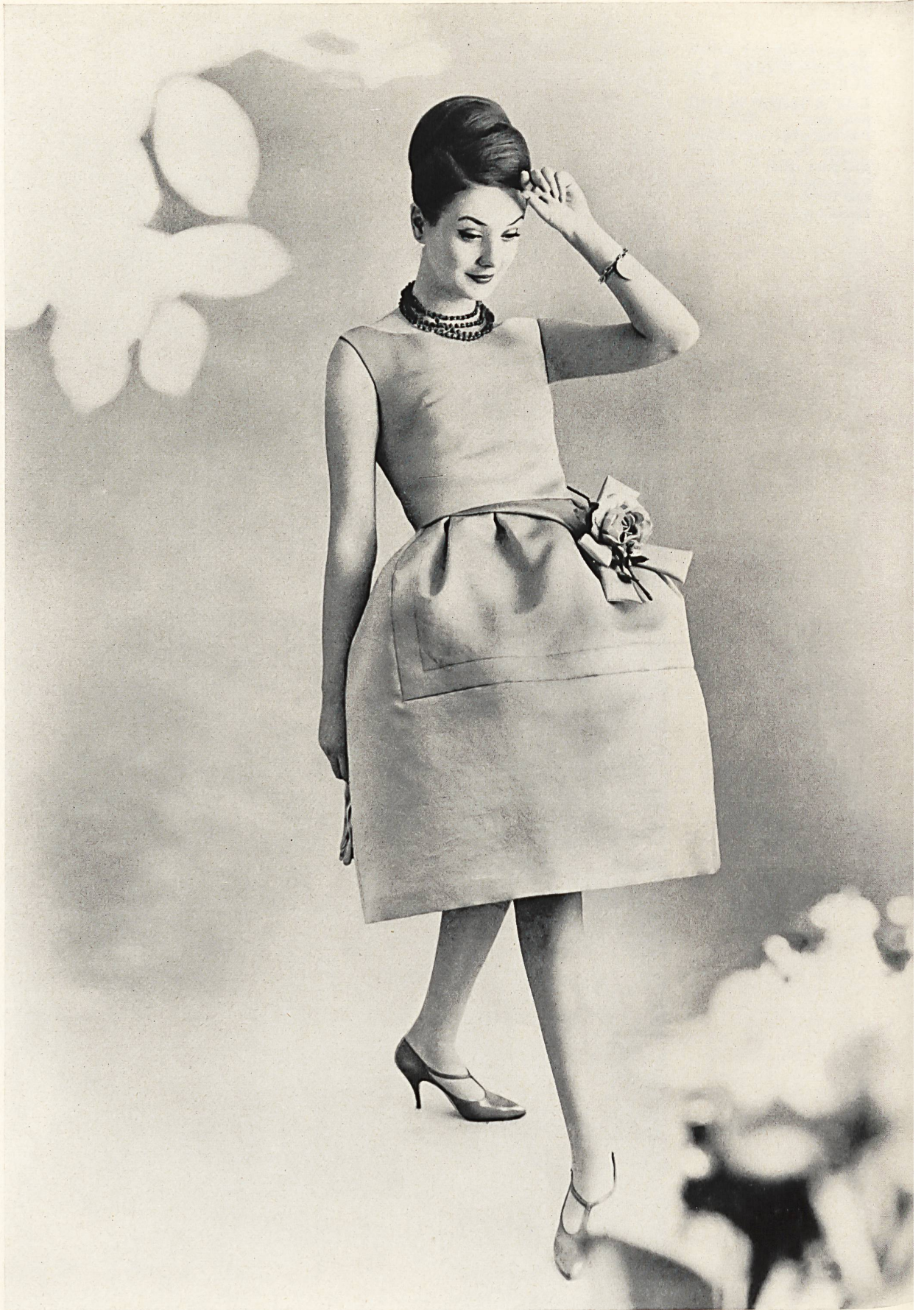
Modèle E. WEBER & CIE S. A., ZURICH Robe du soir en shantung Mandarin pure soie Pure silk Mandarin Shantung evening dress Vestido de noche de shantung Mandarin pura seda Abendkleid aus reinseidenem Mandarin-Shantung