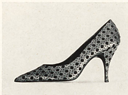
Brocade "International" line

For men, the trend is also towards the square style. The exaggeratedly pointed styles are quite out of fashion now, and the prevailing trend is definitely towards the traditional English look. The loafer, now accepted for town and office, is cut fairly high for town, to go with the currently fashionable trousers without turn-ups. Uppers fitted on elastic make these models fit perfectly. Among the "avant-garde" creations, let us mention the Wellington boot with short elastic upper, as worn at one time by army officers. The colours are definitely autumnal; mention should also be made of the "Custom Smoke" patina used for men's as well as women's shoes, which gives a typically craft look to aniline dyed leathers.