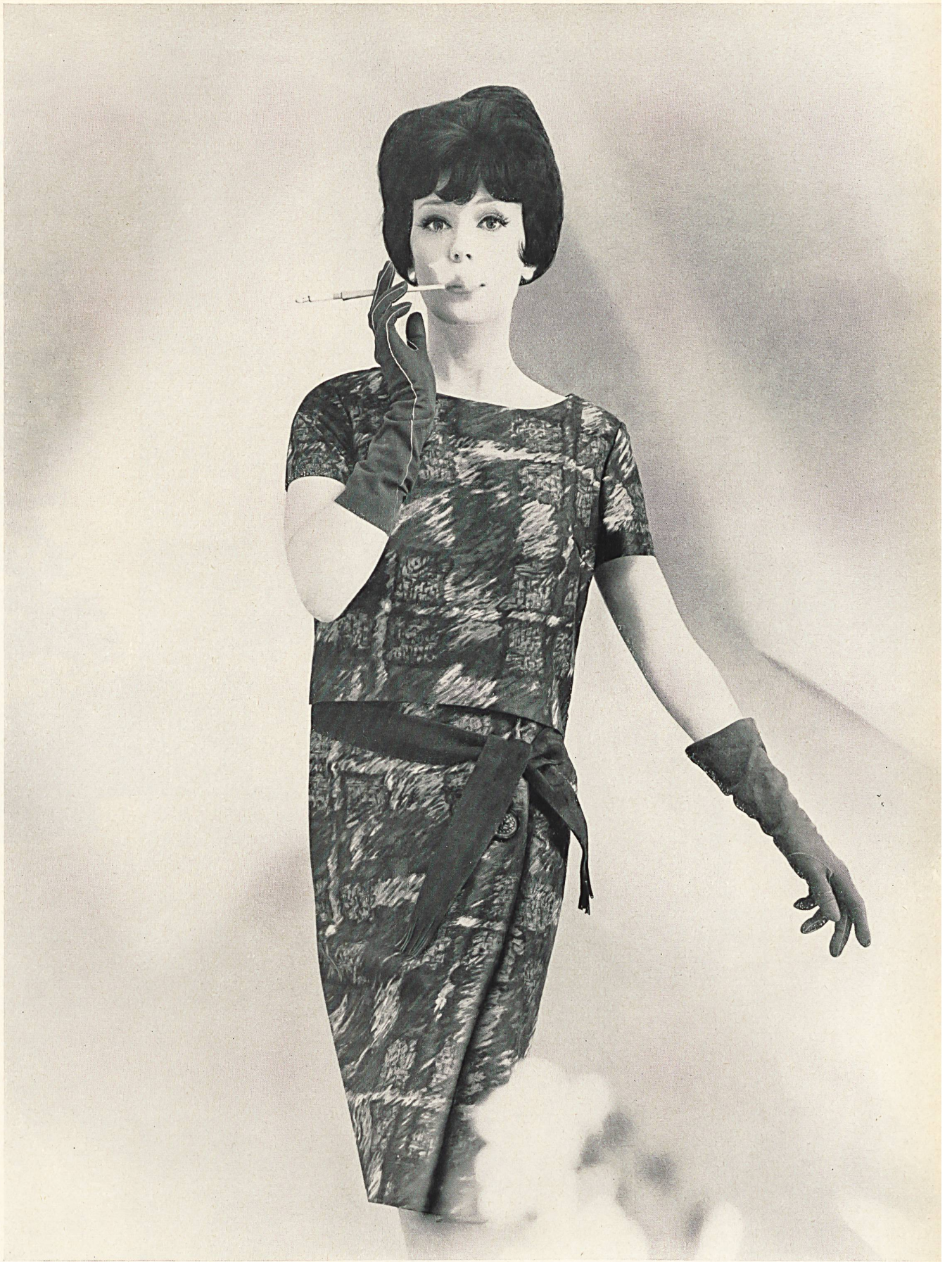
Modèle E. WEBER & CIE S. A., ZURICH Robe d'après-midi en pure soie Pure silk afternoon dress Vestido de tarde pura seda Reinscidenes Nachmittagskleid