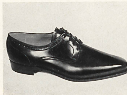
"Vogue" line, square style