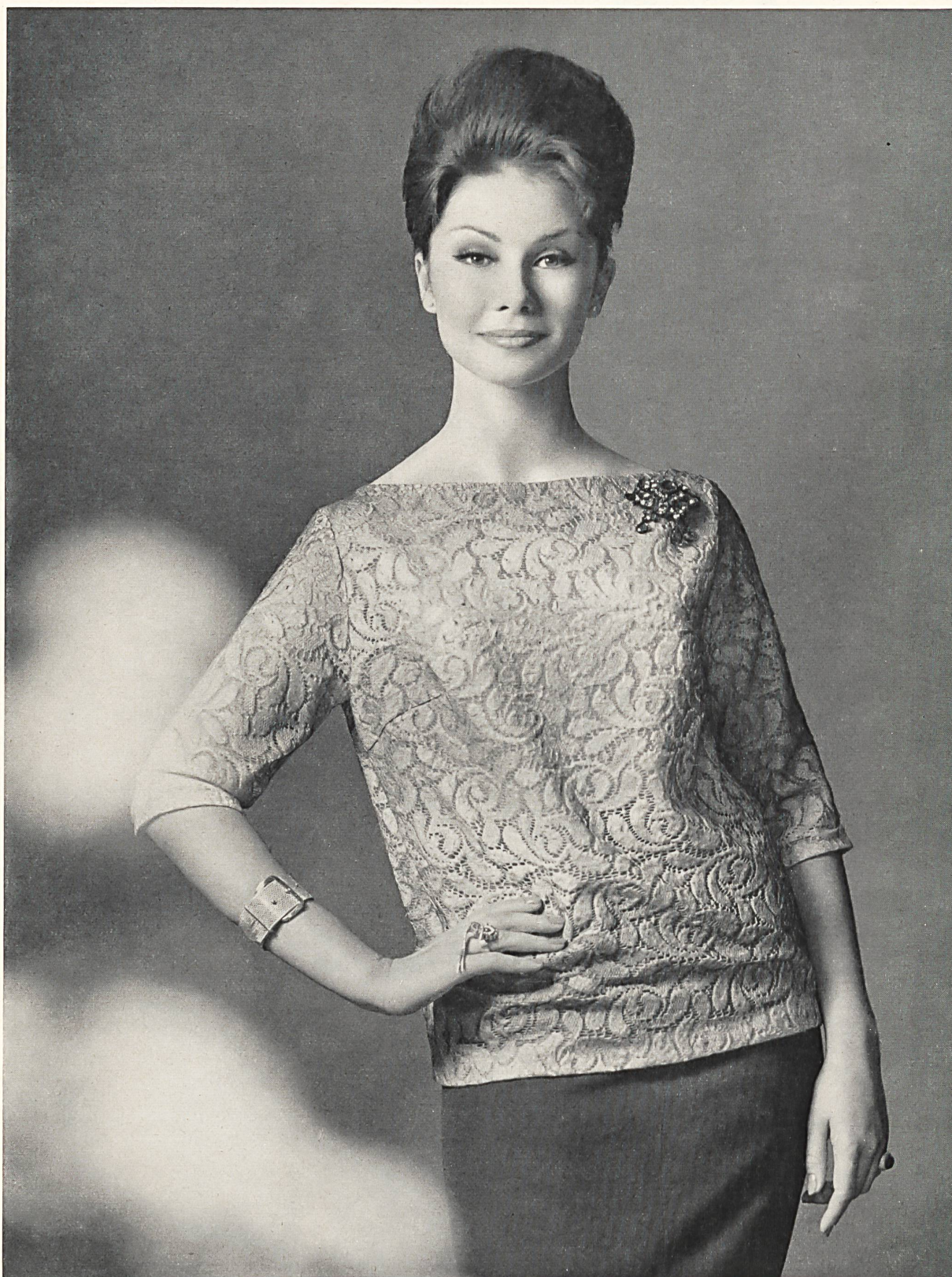
Modèle « SAMODE », MODEN S. A., MONTREUX Fabrique de robes et blouses Blouse en dentelle de laine de couleurs Multicoloured wool lace blouse Blusa de encaje de lana multicolor Bluse aus farbiger Wollspitze