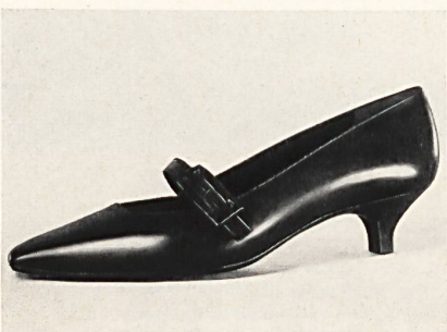
"Madeleine" line, square style