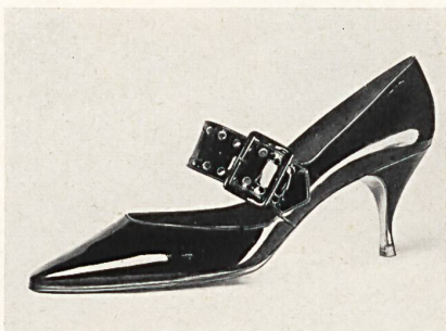
"Madeleine" line, Sultana style