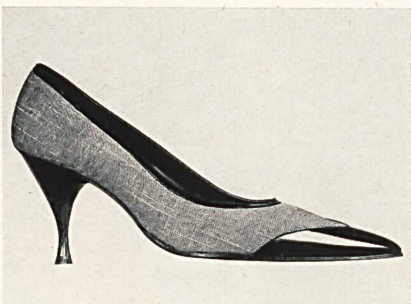
"International" line, Ritz style, patent and tweed