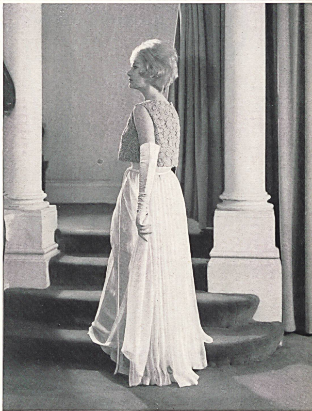
Modèle Mattli, London