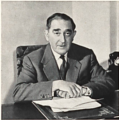
Sir Simon Marks, the brain and the power behind Marks & Spencer

With Swiss cottons continuing to hold their own, despite the great advent of synthetics into the world markets, this might be a good time to examine the great strength of a great store, some idea of whose size and buying power can be gained from the fact that during the first half of this year it bought over 12 million yards of embroidered trimmings and novelties.