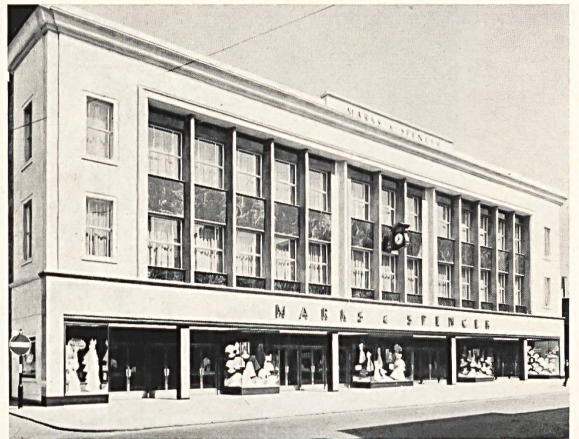
One of Marks & Spencer's Department Stores, London