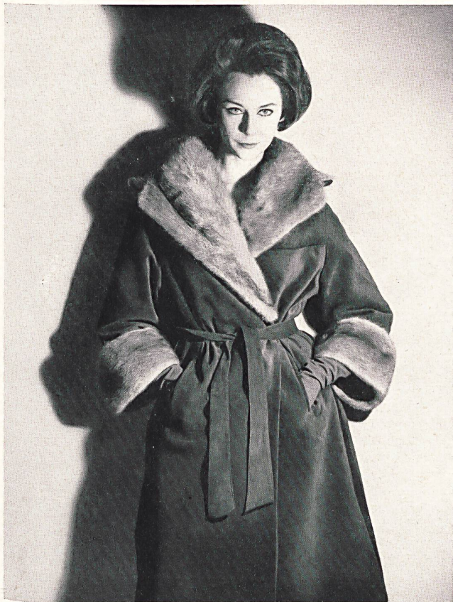
Manteau de daim confectionné en Suisse A nigger starcalf coat made in Switzerland Abrigo de gamuza confeccionado en Suiza Brauner Suède-Mantel, schweizerischer Fabrikation Modèle Berg of Mayfair, London

to his offices in the Baker Street block. In the atelier, a team of over 40 designers play their part in the scheme of things and there begins the evolution of a garment towards its ultimate destiny.