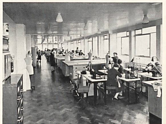
In the cutting rooms