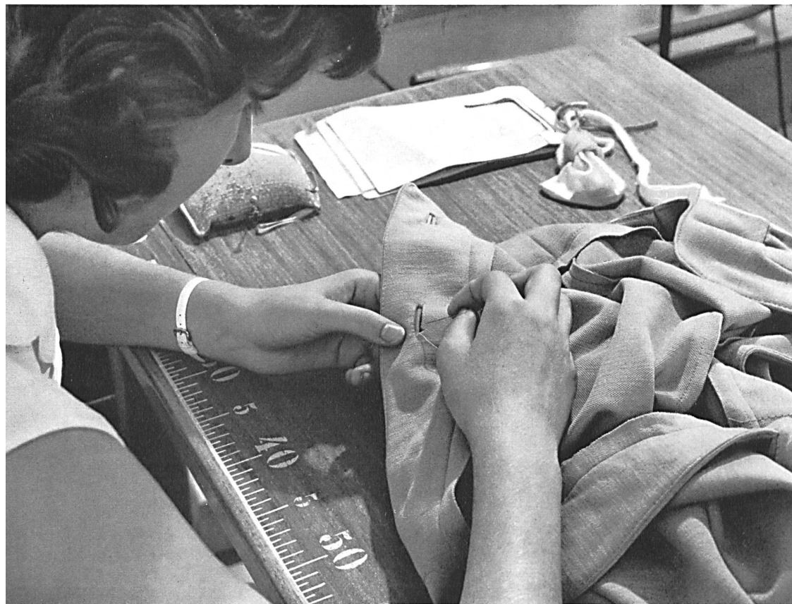
The Swiss knitwear industry lays great importance on the vocational training of future generations