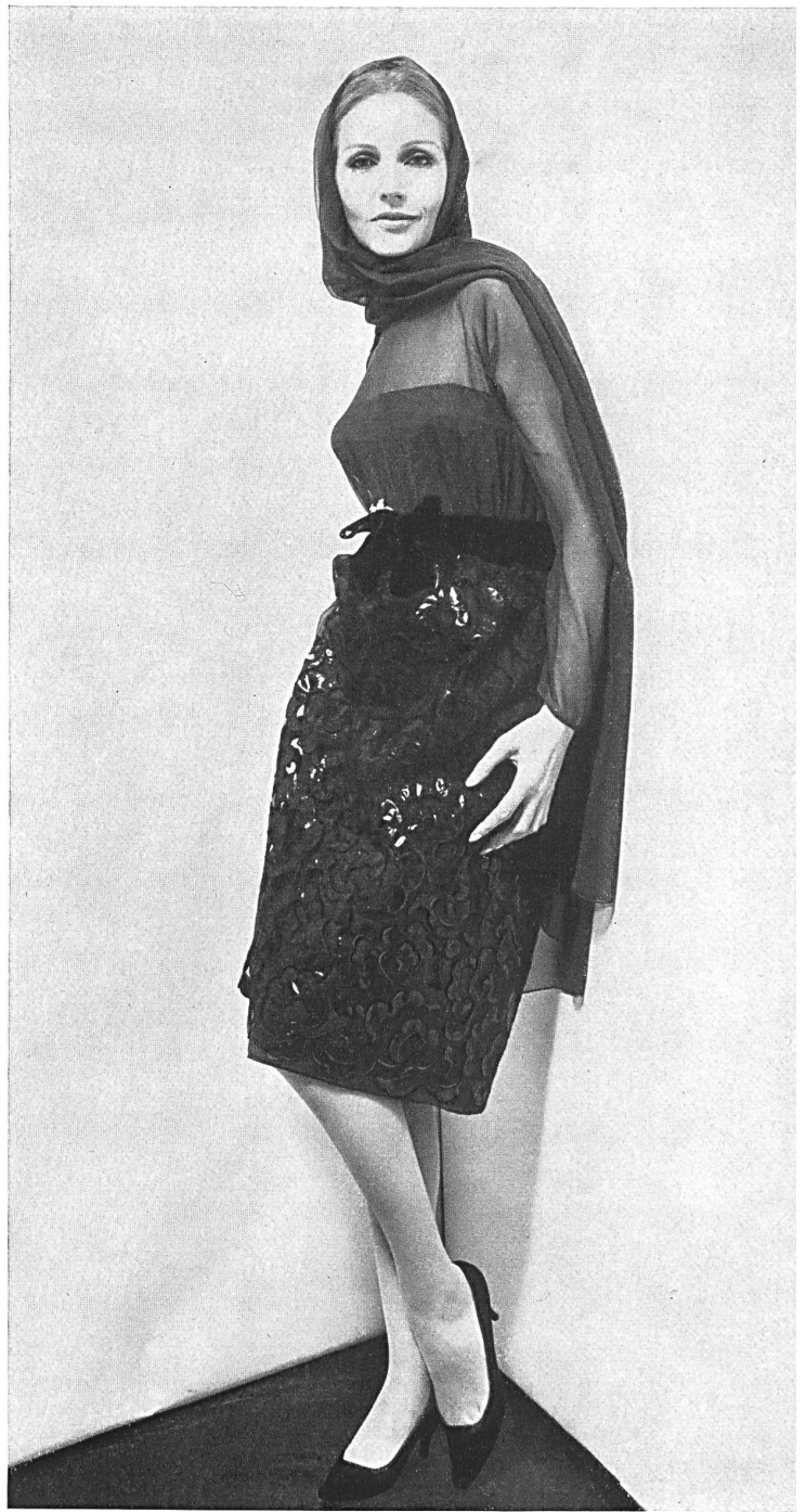
FORSTER WILLI & CO., SAINT-GALL

The black costume is still chic, but black must add some special note to compete with the flower-garden hues.