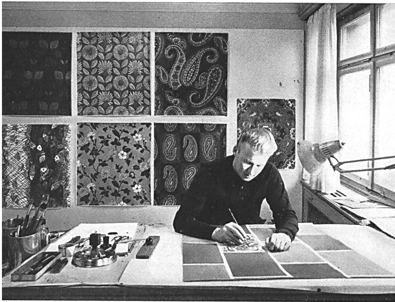
In the designing workshop