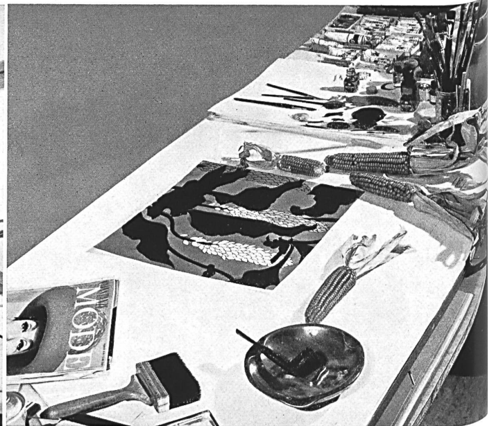
From the original inspiration to the finished design

into new premises in St. Gallerstrasse where the company into which it was later converted, Hausammann Textiles Ltd., still has its offices today, the premises naturally having been greatly expanded in the meantime.