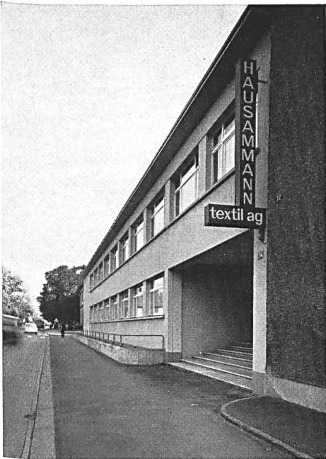
Main entrance in St. Gall Street