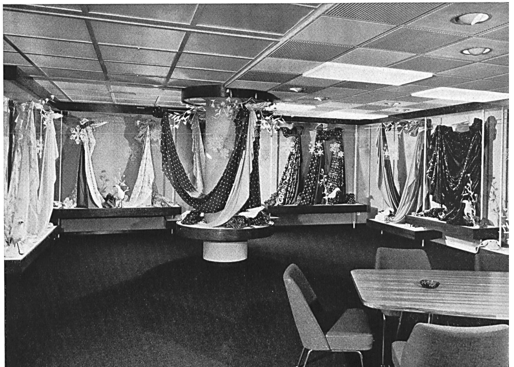
Show and sales room