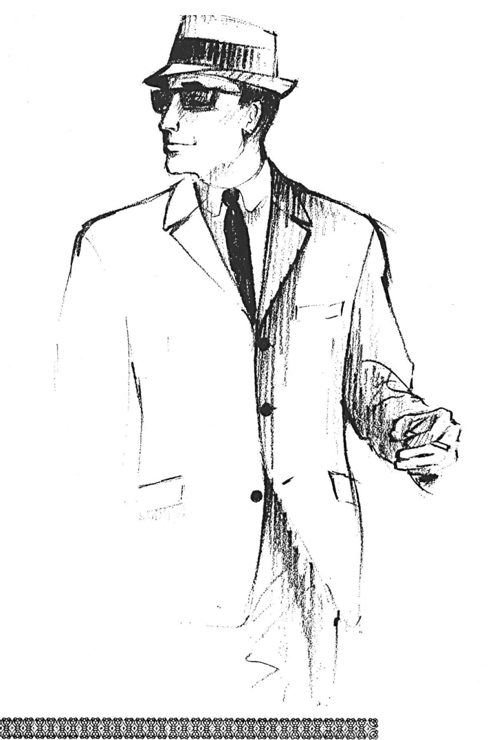
MEN'S READY-TO-WEAR CLOTHING