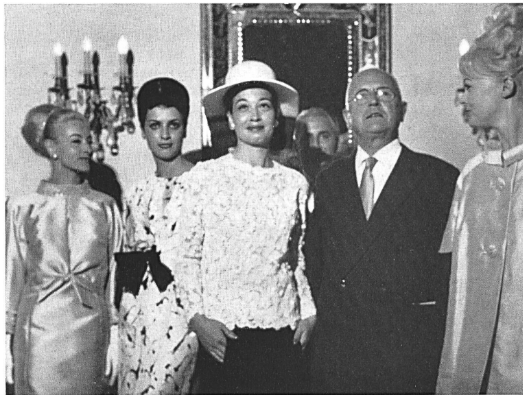
M. Emile Landolt, maire de Zurich, entouré des mannequins qui ont présenté des modèles en soie aux participants au Congrès. Mr. Emil Landolt, Mayor of Zurich, surrounded by the mannequins who presented silk garments to congress members El Sr. Emile Landolt, alcalde mayor de Zurich, rodeado de los maniqués que han presentado modelos de seda a los asistentes al Congreso. Dr. Emil Landolt, Zürichs Stadtpräsident, mit den Mannequins, welche die Modelle aus Seide den Kongressteilnehmern vorgeführt haben

The 9th International Silk Congress was the occasion for a number of receptions and fashionable events as well as a special programme of tours and excursions reserved for the ladies. Their work over, congress members, joined by numerous members of the Swiss textile industry and the press, attended a banquet followed by a very enjoyable farewell ball.