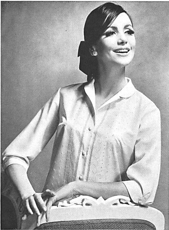
Blouses brodées en pur «Térylène», «Sedusa Schappe Quality» Modèle: Metzler S.A., Saint-Gall

The success met with by synthetic fibres has led to the appearance of a new trend: propaganda at the raw material level, undertaken by the producers of the raw material. This new move has led to a series of publicity campaigns and exhibitions which have the advantage of enabling clothing manufacturers to select the fabric that suits them in any particular material, from among the products of all the weavers using it.