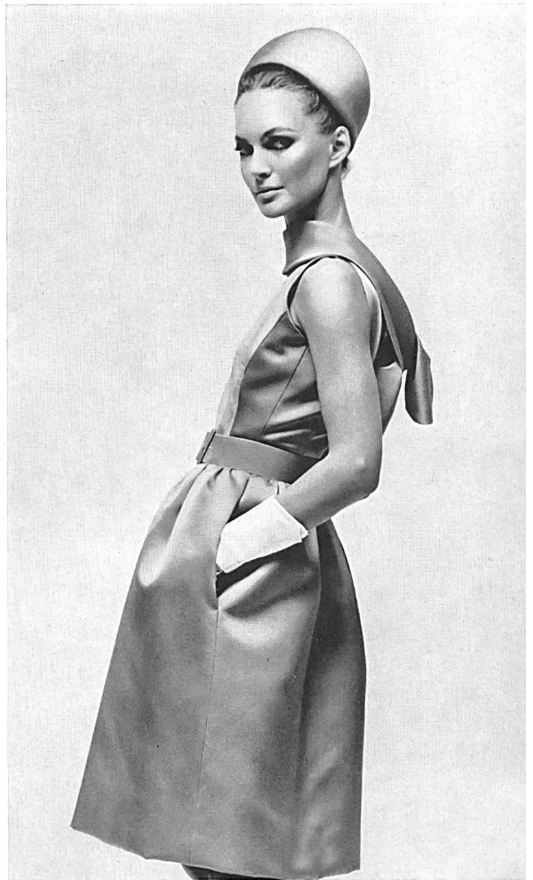
L. ABRAHAM & CO. SILKS LTD., ZURICH