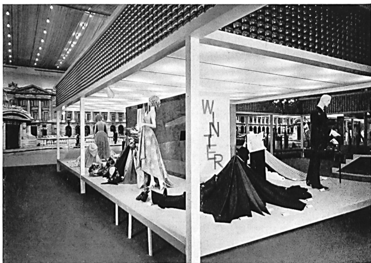
Deux aspects du salon «Création», s'ouvrant sur des perspectives parisiennes Two views of the «Creation» salon with its Parisian decor.