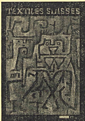
OUR COVER See page 117