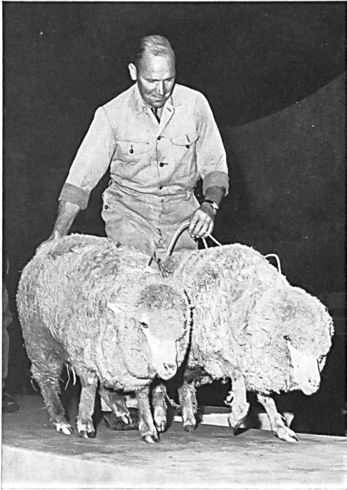
The presentation of two Australian merino sheep

Two features shared by the Swiss wool textile industry and the Bally footwear factory are that they both belong to the field of clothing and both maintain worldwide relations for their exports. These common interests encouraged them to give a very original and highly successful joint display last September in the magnificent gardens of the Bally Footwear Factory. Approximately 400 representatives of the press and various circles had been invited to Schönenwerd, where they were entertained, in a circus tent specially set up for the occasion, by different perfectly staged and produced «numbers». There was a very interesting series of lectures on technical subjects cleverly combined with documentary and fashion displays. Six merino sheep, flown in specially by Swissair (three from South Africa and three from Australia) and a number of Swiss sheep, paraded on the podium accompanied by mohair sheep, alpacas, llamas, sheep from Cashmere, moufflons and a camel kindly loaned by the Basle Zoo. To their amazement and great delight, the spectators were also treated to the shearing of two sheep by Swiss experts. A number of interesting details were revealed on this occasion such as, for example, that there are approximately 2000 different types of wool and that Switzerland's wool consumption is equivalent to 8 million fleeces. The fashion parade which followed showed wool in all its most varied aspects, from the garment for everyday wear to the evening dress in St-Gall wool