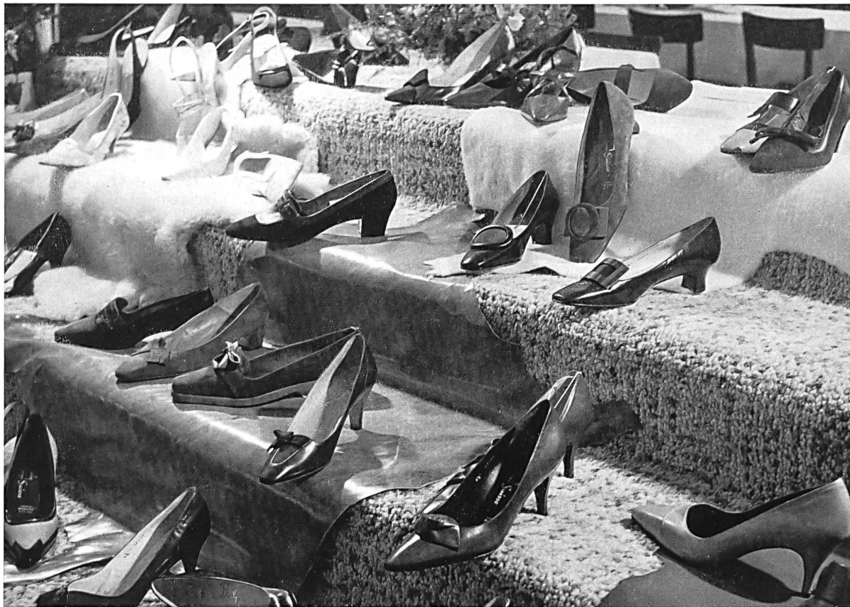
Modèles BALLY déposés

A partial view of the rich exposition of Bally shoes presented on this occasion in a woollen setting