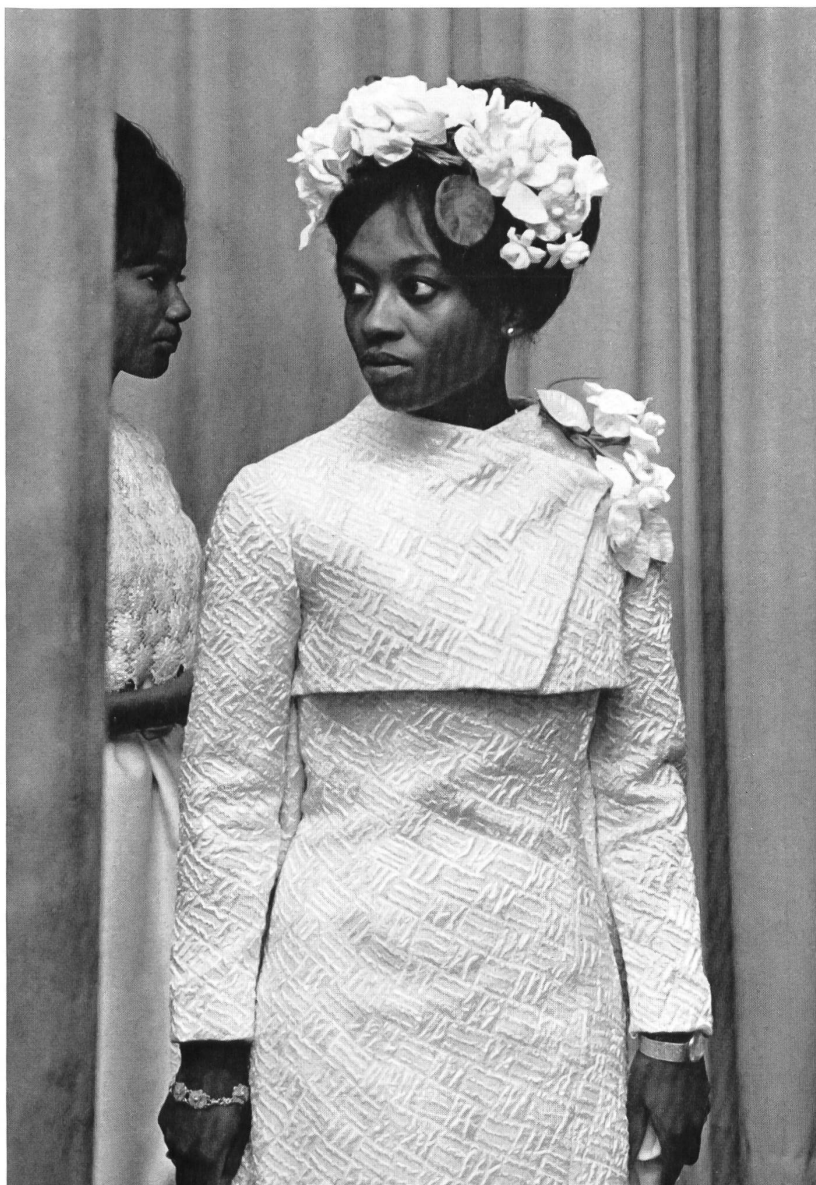
At the end of the parade, Miss Coö Wilhelmina Tubman, youngest daughter of Mr. and Mrs. W.C.S. Tubman, modeled a bridal gown by H. Haller & Co., Zurich.