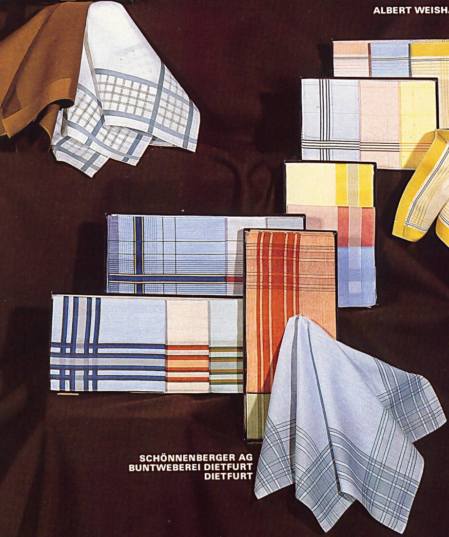
SCHÖNNENBERGER AG BUNTWEBEREI DIETFURT DIETFURT

The rich collection produced by the Dietfurt Schönnenberger Ltd. Colour Weaving Mills at Dietfurt consists of beautifully made handkerchiefs, which are designed not only for show but also for practical use. The colour-woven handkerchiefs in combed Maco satin with their classical striped designs remind us of the days before paper tissues were invented when no one would dream of going out of the house without this indispensable accessory. These articles are set off with woven satin stripes in very fashionable bright colours. The youthful handkerchief features striking fresh tones, while the ladies' range favours pastels. For men's handkerchiefs, the emphasis is mainly on green and blue combined with white or grey grounds.