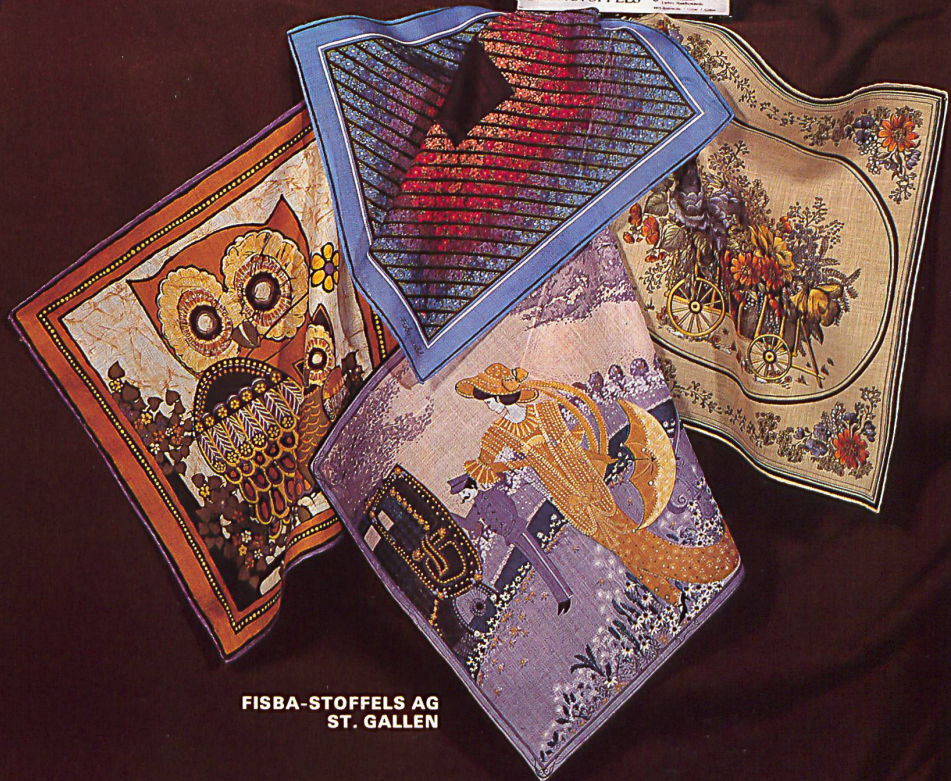
FISBA-STOFFELS AG ST. GALLEN