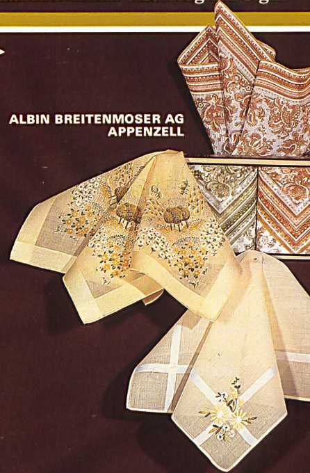
ALBIN BREITENMOSER AG APPENZELL

▲ For dozens of years now, printed handkerchiefs have been one of the leading specialities of the firm of Max Kreier Ltd., St. Gall, which has made a name for itself all over the world with its own special line. Women's handkerchiefs, 34 cm square, with attractive floral and animal motifs come in beautiful prints of up to 10 colours. Another highlight of the collection is the big range of nautical motifs on 34 cm and 48 cm square handkerchiefs. The collection is completed by small round hankies with dainty floral designs and scalloped hems.