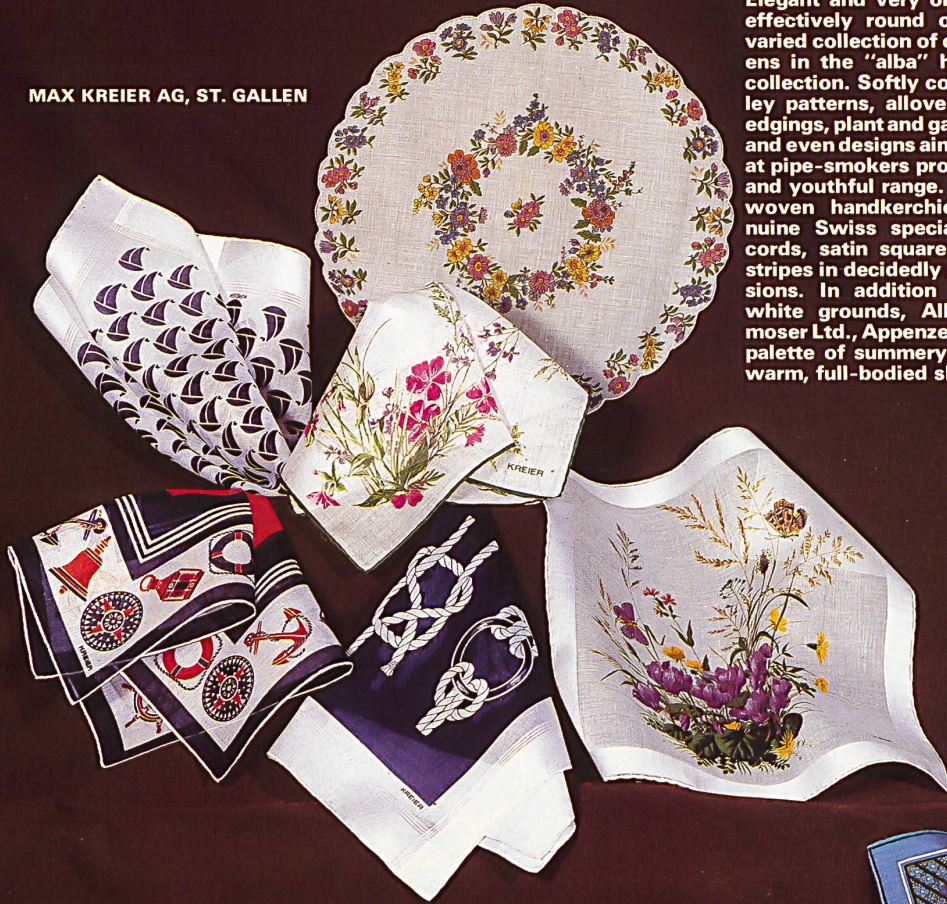
MAX KREIER AG, ST. GALLEN

Elegant and very original prints ► effectively round off the very varied collection of colour-wovens in the "alba" handkerchief collection. Softly coloured paisley patterns, allovers with fine edgings, plant and garden motifs, and even designs aimed specially at pipe-smokers produce a wide and youthful range. The colour-woven handkerchiefs are genuine Swiss specialities: clipcords, satin squares, and satin stripes in decidedly modern versions. In addition to classical white grounds, Albin Breitenmoser Ltd., Appenzell, presents a palette of summery pastels and warm, full-bodied shades.