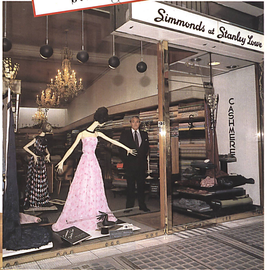
Exclusive Swiss fabrics in elegant surroundings.