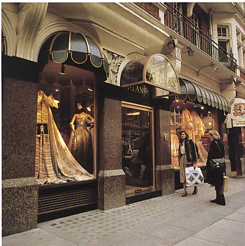
Beautiful embroideries – artistically displayed.