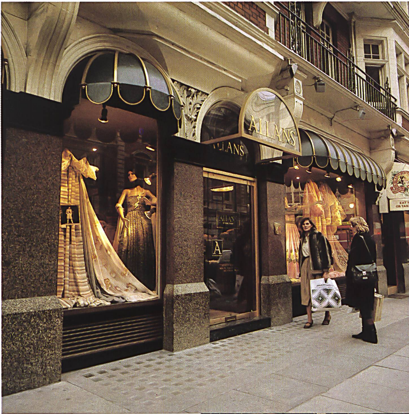
Beautiful embroideries – artistically displayed.