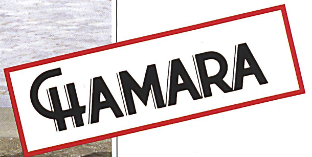
Matching shirt-stripes in cotton/ linen from R. Müller + Cie AG, Seon. Mod. Chamara – Summer 1983.