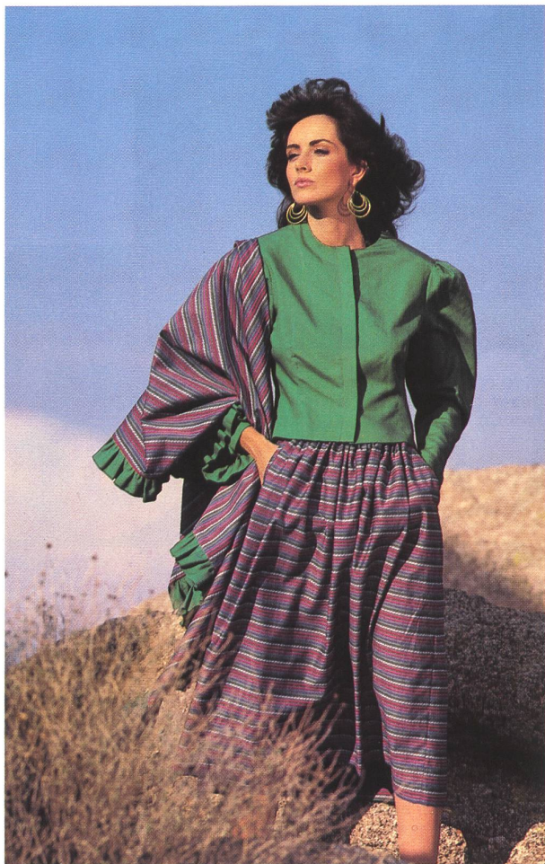
Colour woven pure cotton from Wetter + Co. Ltd., Herisau