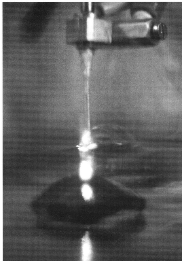
Fig. 1 Plasma pencil – RPJ in combination with 1% solution of Complexon III for applications on

a) historical glass (used gasses were argon, nitrogen, C_5F_8 , mixture of argon and SF_6 )