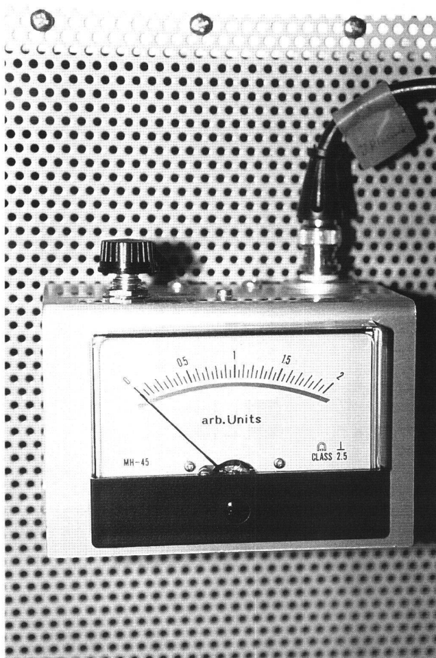
Fig. 2 Plasma current instrument.

From the vacuum pump, after compressed air is added, the gas-mixture enters the combustion chamber where all dangerous components will be burnt. Since this equipment was first delivered to us we have gained a lot of experience in its use and in improvements for conservation treatments.