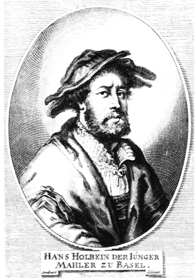
Fig. 3 Hans Holbein the Younger. Illustration from Joachim Von Sandrart, "L'Accademia Todeasca della Architettura, Scultura et Pittura, oder Teutsche Academie der Edlen Bau-, Bild- und Mahlerey-Künste", 2 vols., Nuremberg and Frankfurt 1675–1679, I,2 p. 249.

market, the Grand Duke wrote to Arundel, and begged him to part with a jewel from his own stock, "because I have become passionately set upon having a work by this artist". 22 Arundel duly behaved as a perfect courtier, surrendering the only Holbein portrait which he could not