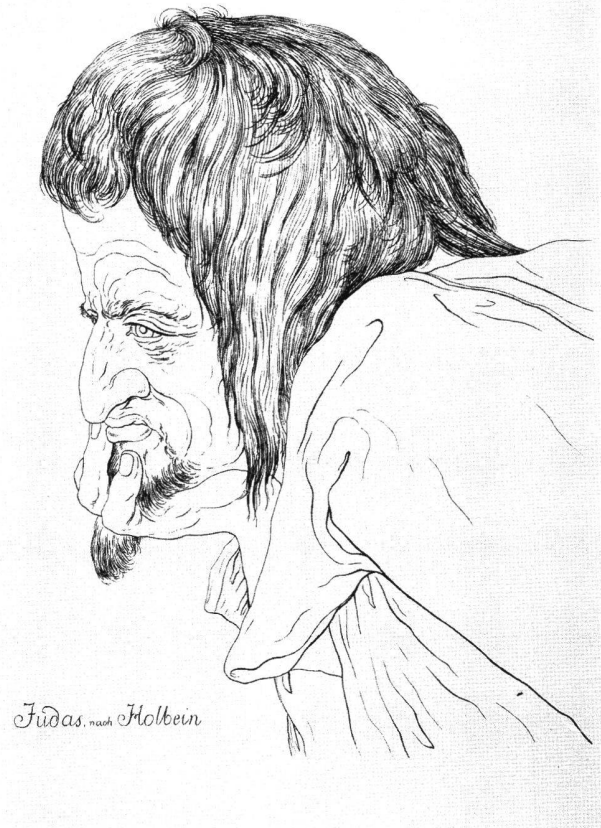
Fig. 4 Judas, as painted by Holbein in the Basle Last Supper. Illustration from Johann Kaspar Lavater, "Physiognomische Fragmente, zur Beförderung der Menschenkenntnis und Menschenliebe", Leipzig/Winterthur 1775–1778, 4 vols.

works. To him, contrary to Mariette and Dezallier d'Argenville, they were gothic . His own country house, near Twickenham, marked the birth of the Gothic revival. It had been designed for a man who thought that the Greek style was not the quintessence of architecture, and that private lodgings required a more fanciful style: "one only wants passion to feel gothic". 40 And Strawberry Hill had a Holbein room. 41 Its decoration was neo-gothic; the light was filtered by antique stained-glass windows and the Holbein portraits, copied after the famous drawings in the royal collections, were framed in black and gold borders. The chimney piece was "chiefly taken from the tomb of Archbishop