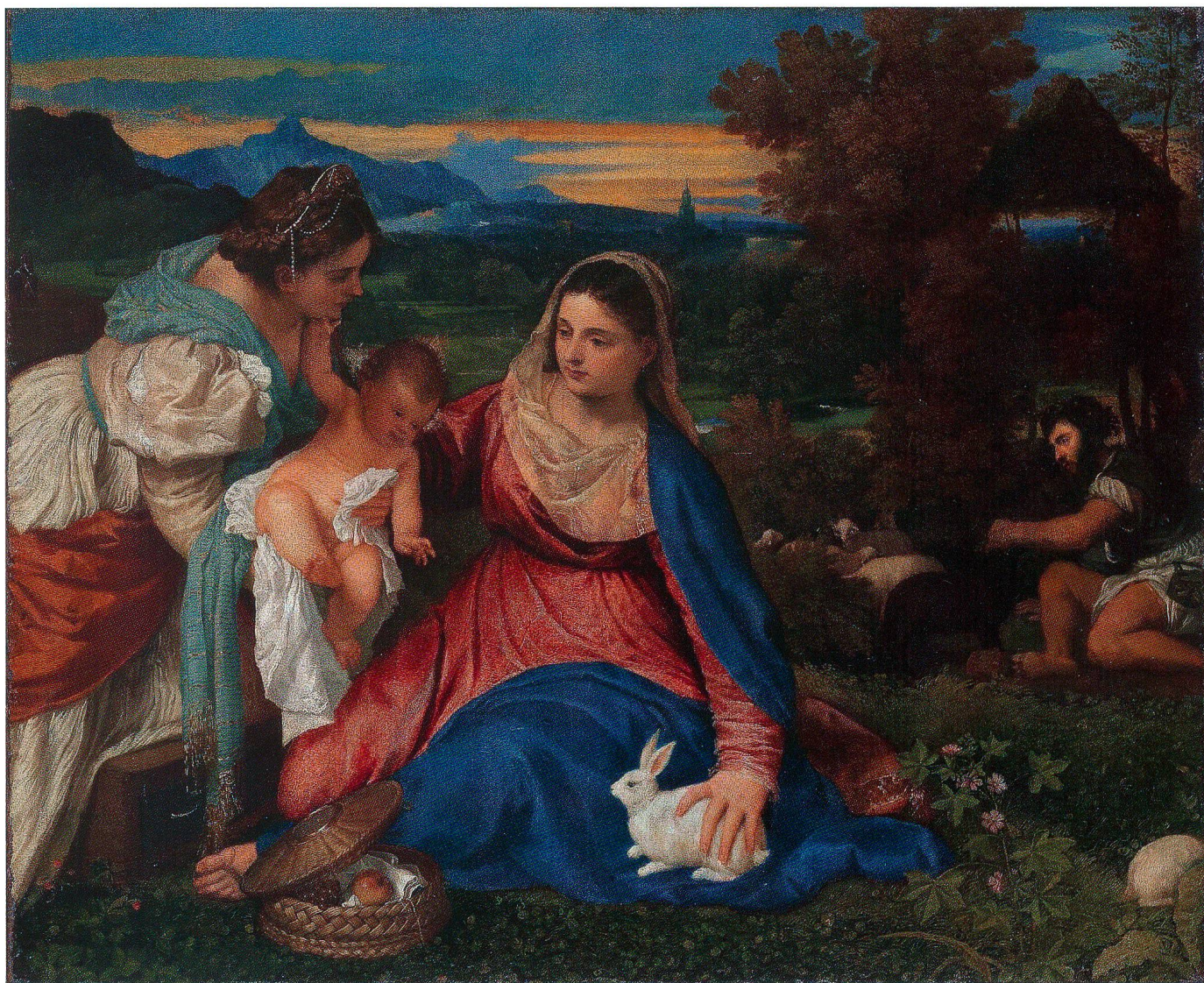
Fig. 1 La Vierge au lapin , Titian, 1530. Oil on canvas, 71 × 87 cm, Musée du Louvre, Paris, Inv. 743. © LAE 2507, C2RMF, Elsa Lambert, 04/06/07.

(Fig. 2): 1 during a conservation campaign in the 1990s, it was determined to be the result of a 19 th century re-painting. 2 According to a committee report of January 17, 1991, «the participants' attention is drawn to a motif shaped like a rabbit, whose body is cut off at its extremity at the bottom right side of the painting. Ms. Malpel notes that the fur's white paint layer is very worn out, and that