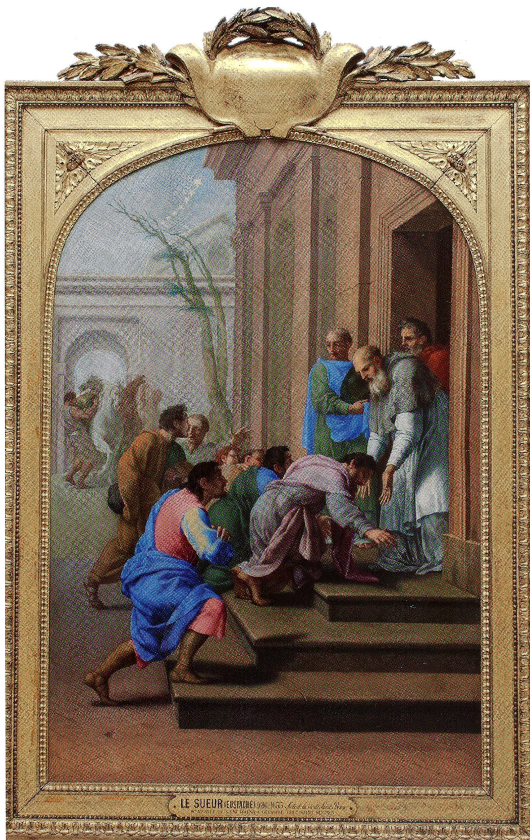
Fig. 7 Arrivée de Saint Bruno à Grenoble, chez Saint Hugues , Eustache Le Sueur, 1645–1648. Transferred from panel to canvas by F.-T. Hacquin, 193 × 130 cm, Musée du Louvre, Paris, INV 8033.