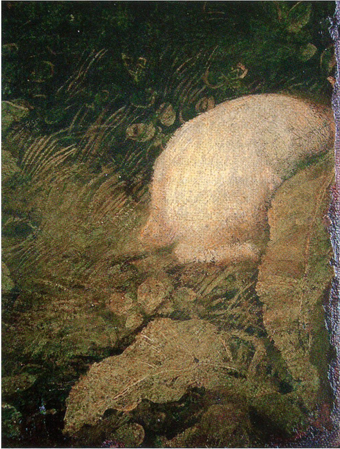
Fig.2 La Vierge au lapin, Titian, 1530. Oil on canvas, 71 × 87 cm, Musée du Louvre, Paris, Inv. 743.