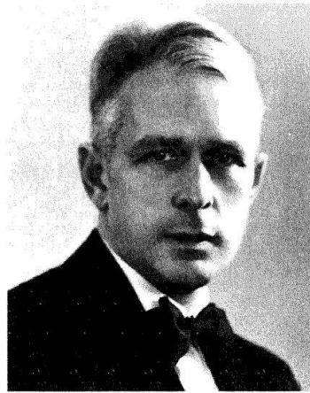
The original caption reads «1938»