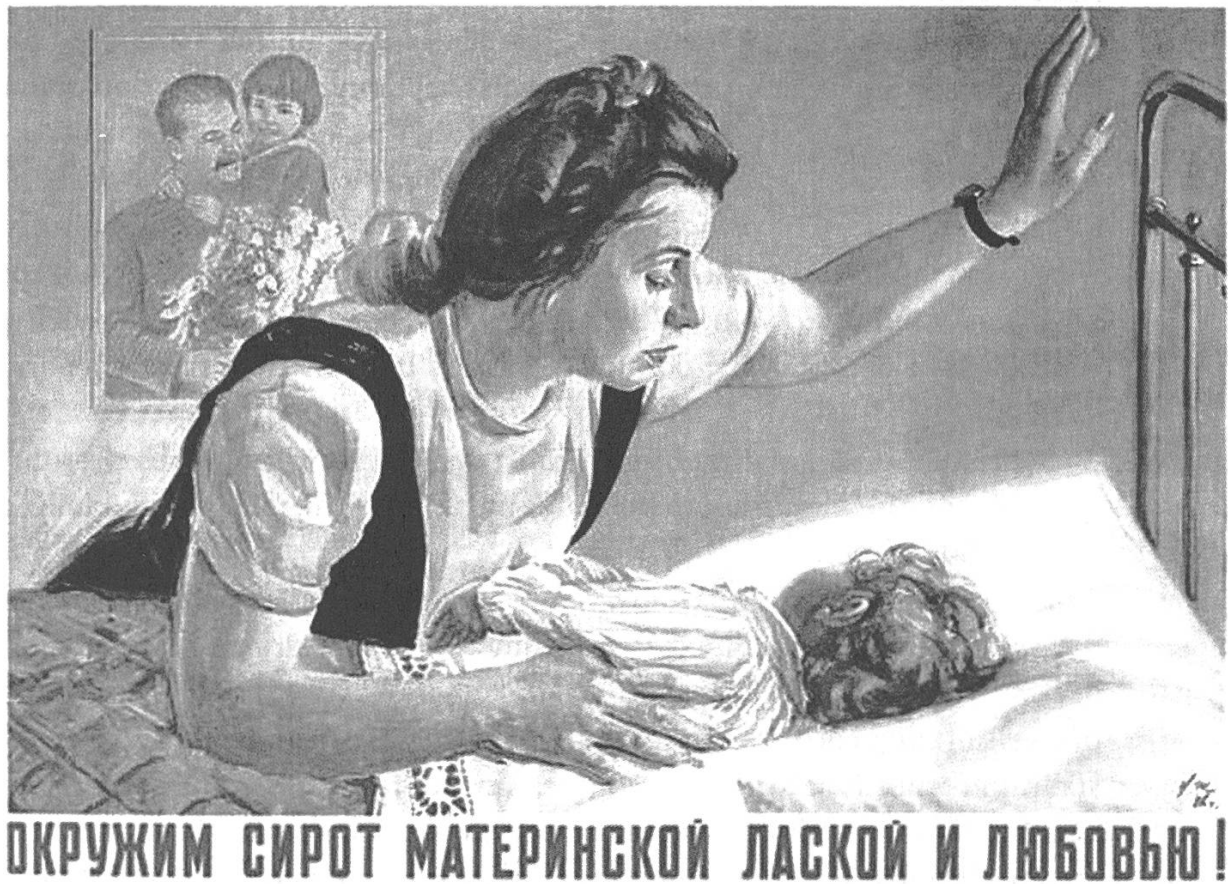
Figure 12: “Let us surround orphans with motherly tenderness and love.” Soviet poster, 1946