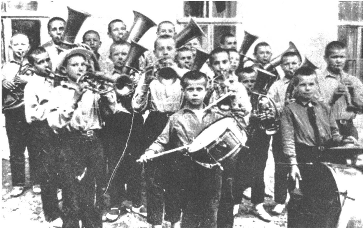
Figure 8: The boys’ brass band as a symbol of “cultureness”, 1930s.

In the world of cultural codes of a children’s home from the 1930s and 1940s, the photos of the working child contain a message clearly received by the spectator about the value of labor and the autonomy of the workers who are self-managed, skilled and well-organized (Figures 2 and 9). Labor participation is a dominant theme in all interviews with the ex-residents of the children’s home Krasnyi gorodok as well as being a central type of image in the album. Talks about the importance of labor (mainly industrial, manual labor) and about its virtual sacrosanctity are commonplace for any person who grew up in 1930s. Such narratives are the natural product of the political system which declared dictatorship of the proletariat as the main doctrine and embellished labor with a special rhetoric. The self-subsistence economy was based on the children’s work in maintaining order and cleanliness on the premises, on cultivating vegetables and fruit, as well as producing clothes. The children’s involvement in productive activity was