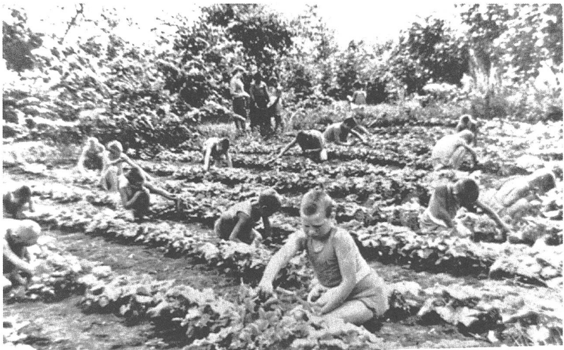
Figure 2: Photo from Krasnyi gorodok album. "Even the little ones have been working. The work can be found for everyone..."

In the words of Roland Barthes (1991), the "photograph is not only perceived, received, it is read , attached – more or less consciously by the public, which consumes it – to a traditional stock of signs; now, every sign supposes a code, and it is this code (of connotation) which we must try to establish" (p. 7). The childhood images in the albums include somewhat