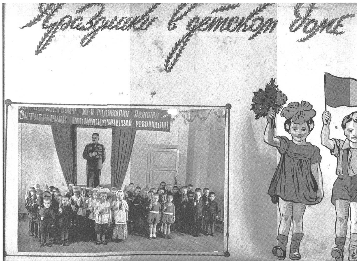
Figure 3: Morning festival devoted to the 30 th Anniversary of the Great October Socialist revolution. Photo from the album of the children’s home/kindergarten, 1946–47

In a post-war album from the other institution there are signs of “happy childhood”: poses and smiles of the moonfaced well-cared-for youngsters, surrounded by caring adults (Figures 6 and 10). Connotations with social, cultural and political context are made during the shooting, treatment and use of photographs. Among the procedures which alter the reality, there are trick effects, poses, objects, while the procedures applied during the treatment of images include photogeny, aesthetism, and syntax (Barthes 1991, p. 9). A number of visual items viewed as texts are subjected to deconstruction in order to show the interrelation between consumption and production in the practice of photography. The pictures from the archive of the orphanages were professionally taken and arranged into the institutions’ album for the celebration of the 30th anniversary of the October Socialist Revolution in 1947. The witnessing capacity of the images was