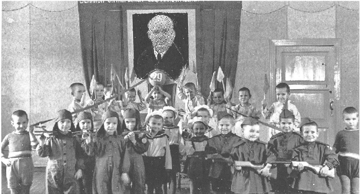
Figures 4 and 5: Morning festivals devoted to the 29 th and 30 th Anniversary of the Great October Socialist revolution. Photo from the album of children’s home/kindergarten (photos taken in 1946–47, re-used for the album dated 1957)

inextricably tied to the ritual “work” as both elements in and artifacts of the ceremony (see Kendall 2006). They show children marching past the huge