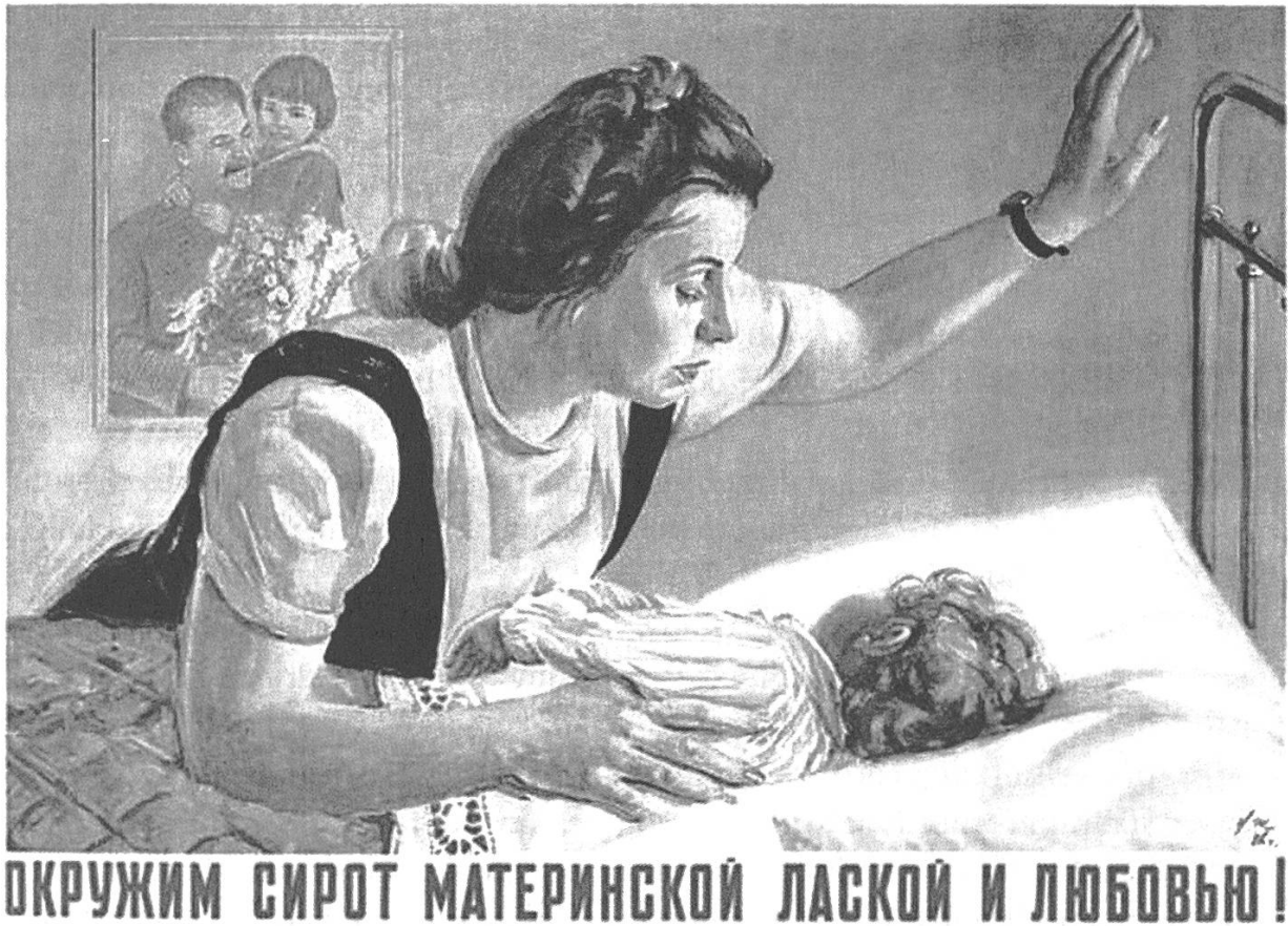
Figure 12: “Let us surround orphans with motherly tenderness and love.” Soviet poster, 1946

in the established order of things was arranged by the adults and proceeded under their vigilant control, even when the children demonstrated certain elements of self-discipline. And although the children called the orphanage “our home”, they still experienced that homelessness which, in the words of Svetlana Boym, is not just a poetic metaphor. Analogous to the life situation in the densely populated communal apartment, “I” could be taken away as well as one’s home or even a room (Boym 1994, p. 93).