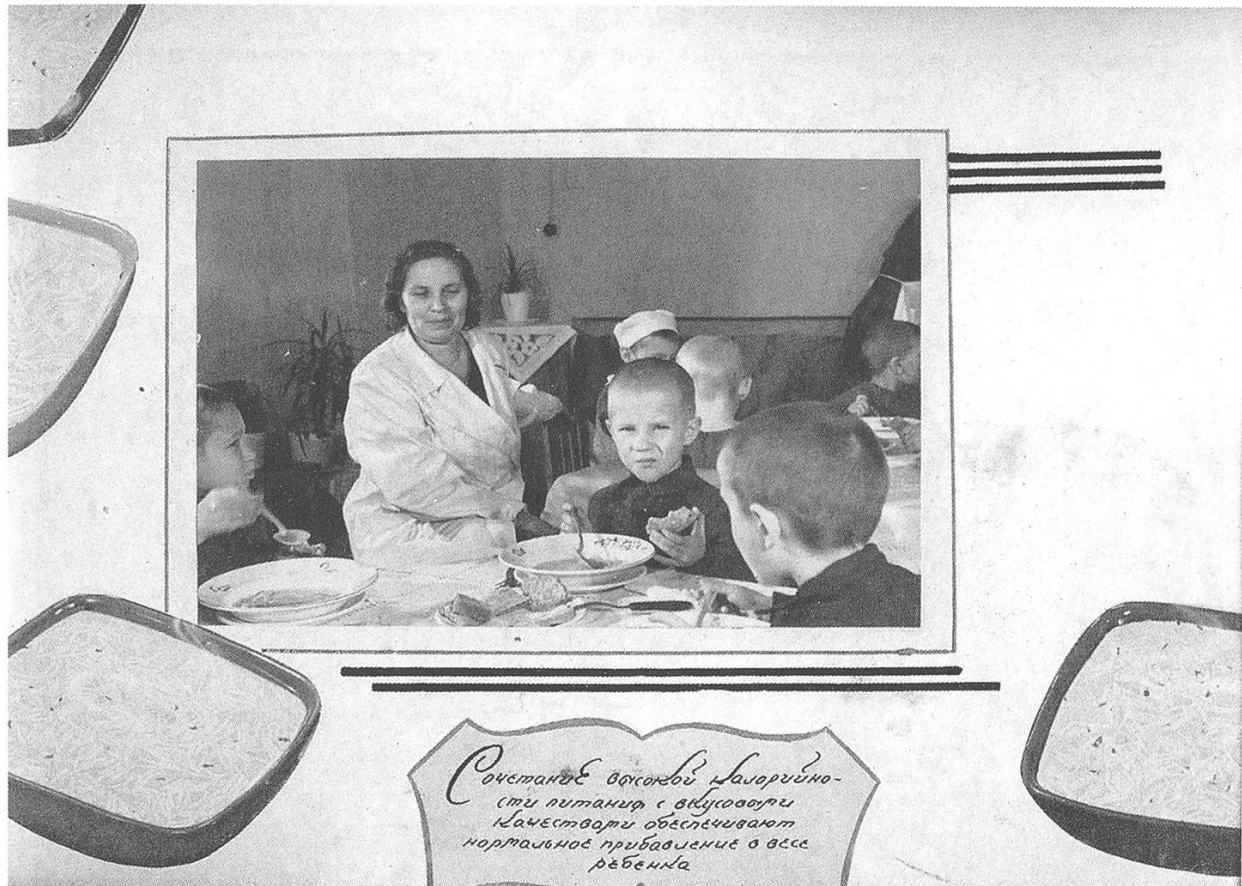
Figure 10: Photo from the album of a children's orphanage in 1947. This is an image of the State providing youngsters with maternal care; the children are depicted as well-fed and happy.

These albums undoubtedly present the official version of an institutional and general political order. Photographs representing children's activities in an orphanage can be read as a message in a wider ideological and cultural context of the 1920s to the 1940s, echoing the professional media discourse on the principles and values of Soviet upbringing, which are presented in posters and other visual media. For example, the pedagogical concerns with bringing up children who can be self-sufficient but at the same time tied to the collective, as well as the concept of social hygiene, are presented in early Soviet posters (Figure 11), as is the concept of institutional child care equal to family care (Figure 12).