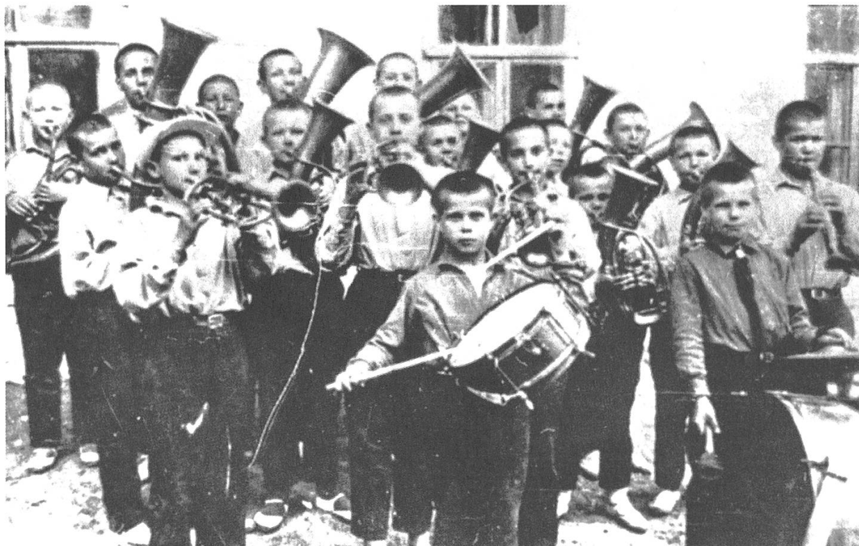
Figure 8: The boys’ brass band as a symbol of “cultureness”, 1930s.

In the world of cultural codes of a children’s home from the 1930s and 1940s, the photos of the working child contain a message clearly received by the spectator about the value of labor and the autonomy of the workers who are self-managed, skilled and well-organized (Figures 2 and 9). Labor participation is a dominant theme in all interviews with the ex-residents of the children’s home Krasnyi gorodok as well as being a central type of image in the album. Talks about the importance of labor (mainly industrial, manual labor) and about its virtual sacrosanctity are commonplace for any person who grew up in 1930s. Such narratives are the natural product of the political system which declared dictatorship of the proletariat as the main doctrine and embellished labor with a special rhetoric. The self-subsistence economy was based on the children’s work in maintaining order and cleanliness on the premises, on cultivating vegetables and fruit, as well as producing clothes. The children’s involvement in productive activity was