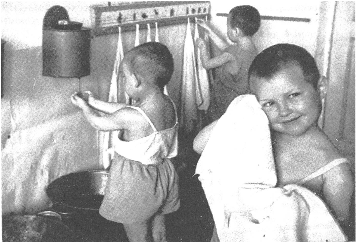
Figures 6 and 7: The images represent social hygiene and collectivity as the elements of socialist upbringing – children are depicted as self-sufficient, disciplined, clean and happy. Photos from the album of the children's home/kindergarten, 1947