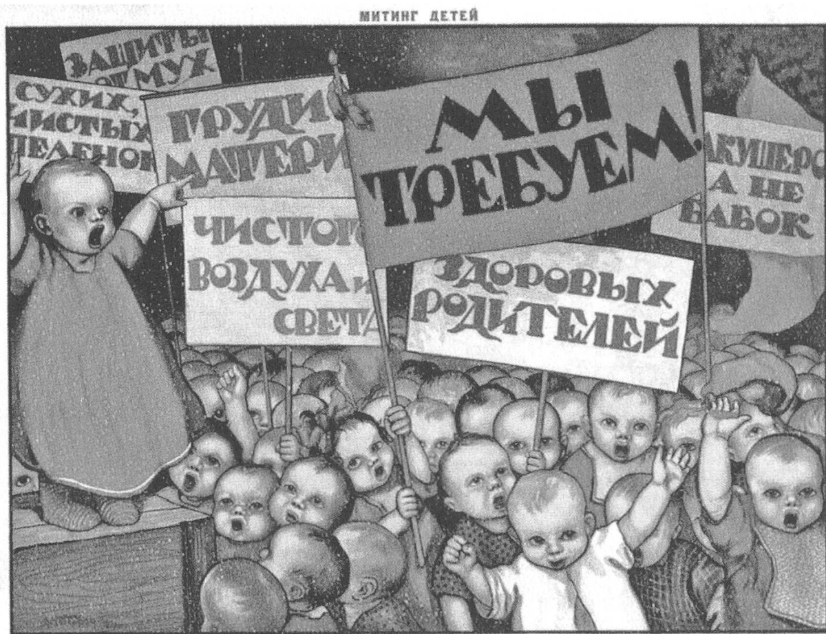
ВЫСТАВКА ПО ОХРАНЕ МАТЕРИНОСТИ И МАЛЕНЬЧЕСТВА. ТАБЛИЦА № 31 Известия «ОХРАНА МАТЕРИНОСТИ И МАЛЕНЬЧЕСТВА» ИЛЛ. Москва.

The children's sense of the collective was formed not in games of recreation but at work, and a pupil was hardly ever left by him- or herself. According to the new family ideology developed in 1920s, the children's homes were to become a polygon of the new techniques of upbringing for the creation of politically relevant alternatives to the family. The negative side of a notion of collectivity and institutional safety was lack of individual space and intimacy, as well as freedom to think independently. Mental formation was promoted through the collective reading of approved literature, collective discussion of the books and films, collective conviction of the deviants. The development of loyalty towards the political order was performed by the creation and reproduction of the "proper" hierarchies, where the leading positions are occupied by the children who are most in tune with the aspirations of the tutors, i.e. the most "cultural", obedient, following officially designated rites and rules. The whole process of becoming involved