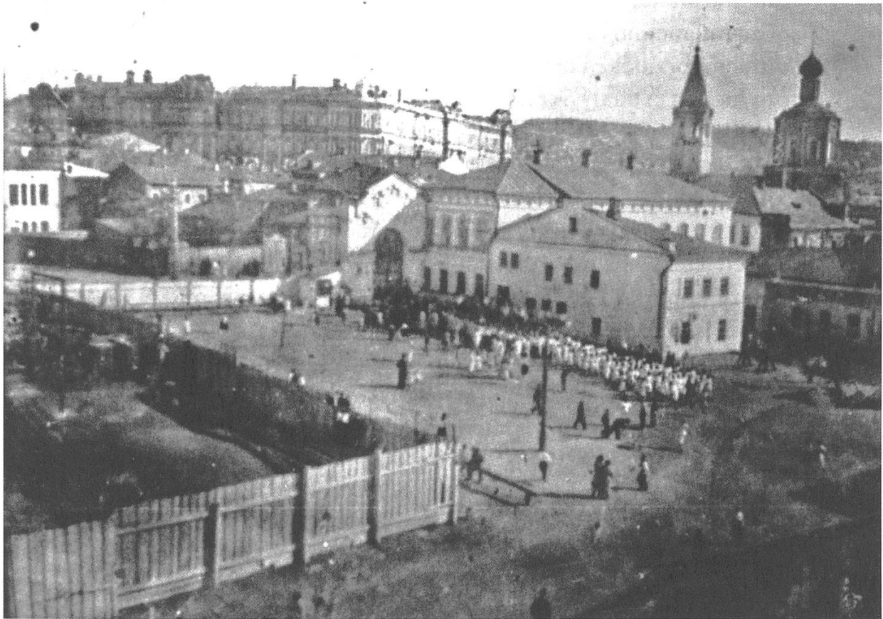
Figure 1: Children's home Krasnyi gorodok , 1930s

tion and pre-selection of visual representations. The fragments of individual memories are brought together and fixed by visual images. While telling a collective story based on the album of the children's home, an informant recollects a cultural mapping of the past, which is shaped after several decades after they left the orphanage. The related narration is important when it comes to reflecting upon this multi-stage process of selection of the materials in order to access and understand the logics of its participants.