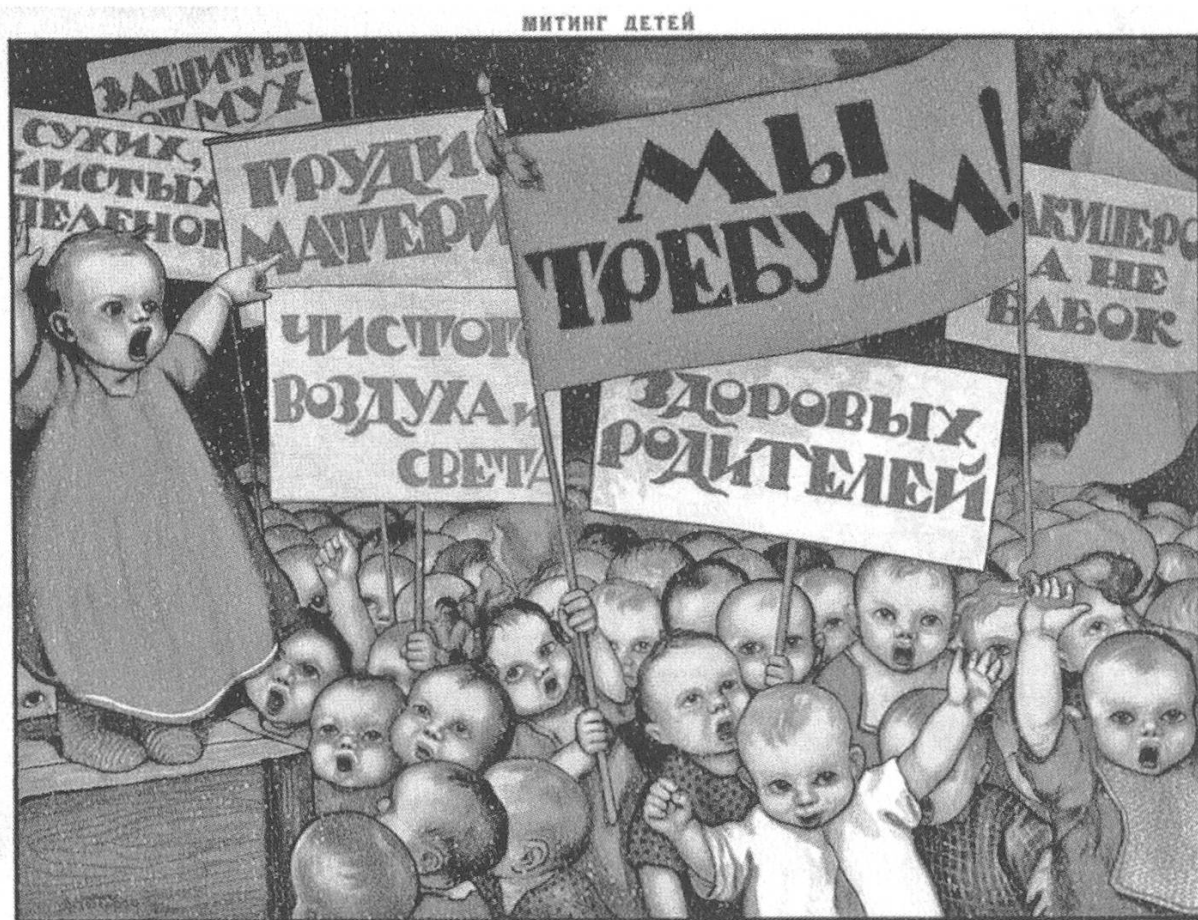
ВЫСТАВКА ПО ОХРАНЕ МАТЕРИШТВА И МЛАДЕНЧЕСТВА. ТАБЛИЦА № 10 Издательство „ОХРАНА МАТЕРИШТВА И МЛАДЕНЧЕСТВА“ ИЛЛ. Москва.

The children's sense of the collective was formed not in games of recreation but at work, and a pupil was hardly ever left by him- or herself. According to the new family ideology developed in 1920s, the children's homes were to become a polygon of the new techniques of upbringing for the creation of politically relevant alternatives to the family. The negative side of a notion of collectivity and institutional safety was lack of individual space and intimacy, as well as freedom to think independently. Mental formation was promoted through the collective reading of approved literature, collective discussion of the books and films, collective conviction of the deviants. The development of loyalty towards the political order was performed by the creation and reproduction of the "proper" hierarchies, where the leading positions are occupied by the children who are most in tune with the aspirations of the tutors, i.e. the most "cultural", obedient, following officially designated rites and rules. The whole process of becoming involved