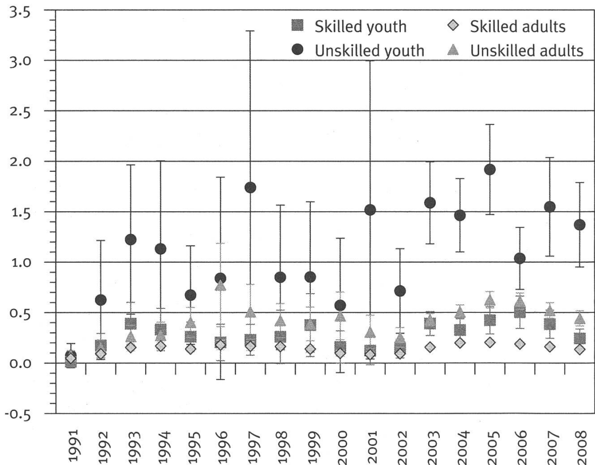
Figure 3 Six month unemployment by age group and skill level

terparts 7 . Unemployment duration is an important parameter in assessing the job prospects of people without employment. Although some time is needed to optimize the job match, a longer duration obviously carries some signalling of unfavourable productive characteristics, which may feed back into the duration itself. Discouragement and social stigma associated with unemployment also render the search less active and extend the unemployment spell, or even drive people out of the labour market. Again, data over a longer period and data on unemployment spells of all durations would help in making a less speculative diagnostic.